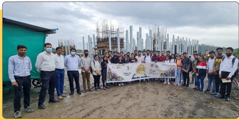
On-site Training Session for Technograhis in Indore, Madhya Pradesh

Light House Project site in Rajkot. They were briefed about the French technology-'Monolithic Concrete Construction using Tunnel Formwork' - which is being used for construction of 1,144 houses with allied infrastructure in Rajkot.