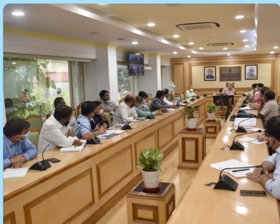
Secretary, MoHUA chairs the 6th meeting of Project Monitoring Committee