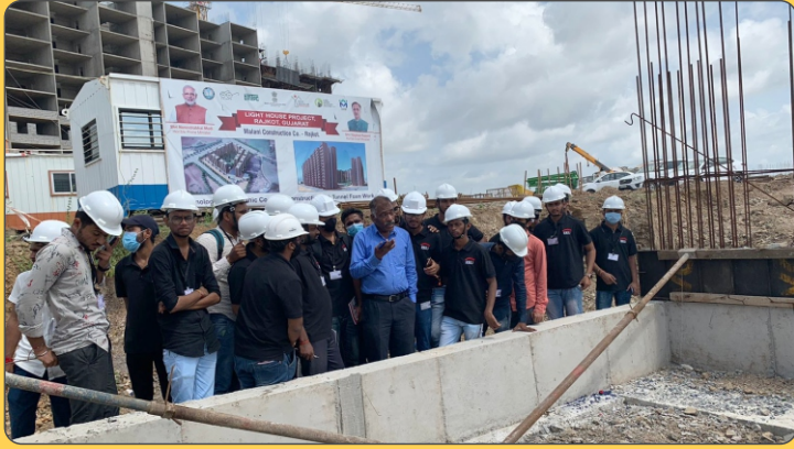
On-site Training Session for Technograhis in Rajkot, Gujarat

An on-site training session was held in Rajkot, Gujarat, for Technograhis, where 50 students with faculty members from Civil Engineering Department of RK University, Rajkot visited