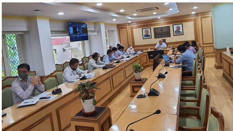
Secretary, MoHUA, & other officials attend 55th meeting of Central Sanctioning and Monitoring Committee (CSMC)

Further, Secretary, MoHUA, urged the States/UTs to participate enthusiastically in 'PMAY(U) Awards -100 Days Challenge'. "Our major