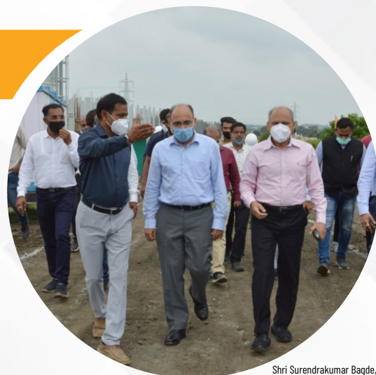
Shri Surendrakumar Bagde, Additional Secretary, MoHUA visited Indore LHP site

The foundation stones for Light House Projects across the six locations were laid by Hon'ble Prime Minister Shri Narendra Modi on 1 st January 2021.